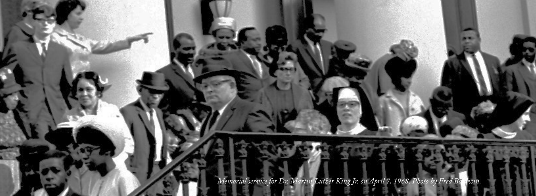
Memorial service for Dr. Martin Luther King Jr. on April 7, 1968.