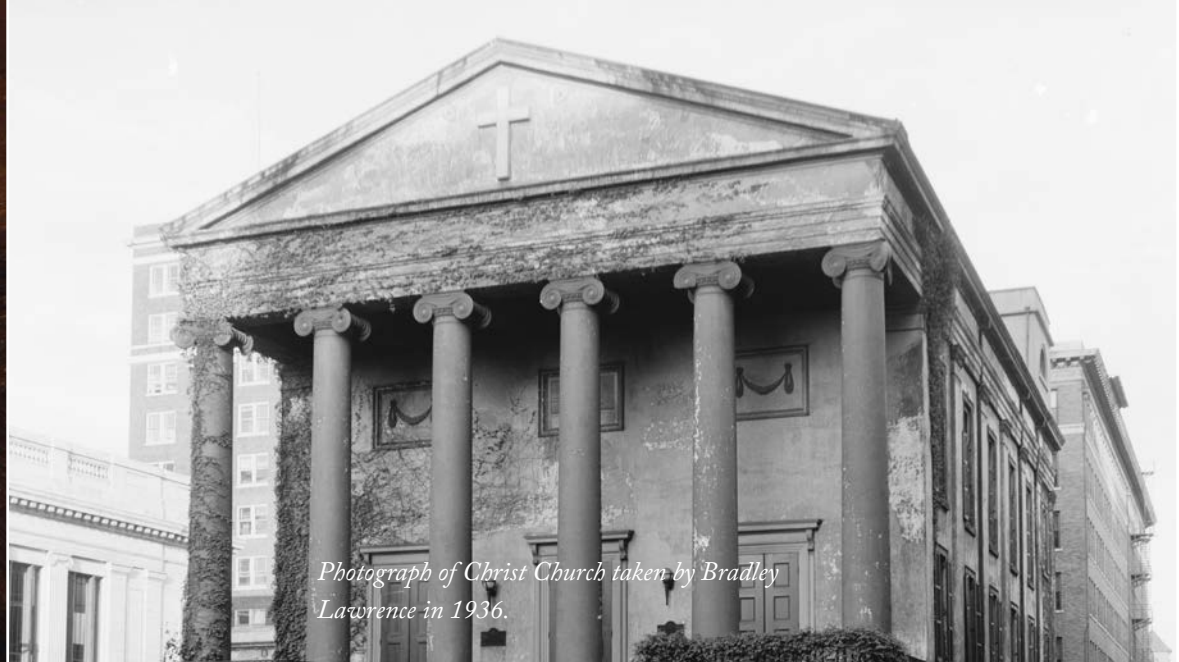
Photograph of Christ Church taken by Bradley Lawrence in 1936.